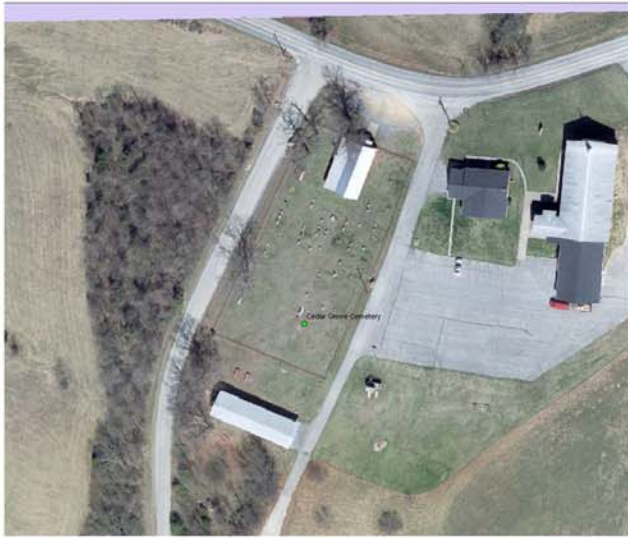
3" Orthophoto 1:750