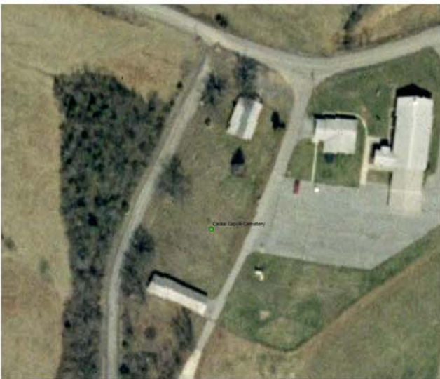
2' SAMB Orthophoto 1:750