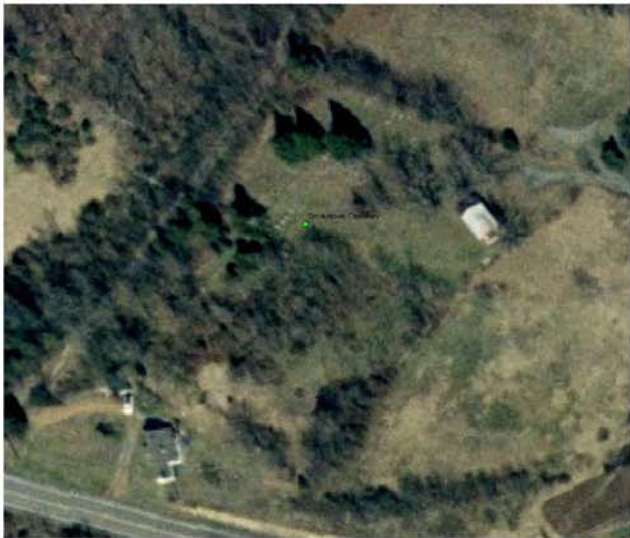
2' Samba Orthophoto 1:750