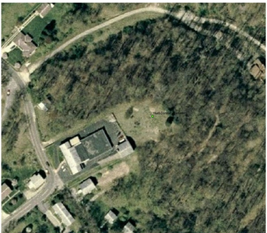
2' SAMB Orthophoto 1:1,000