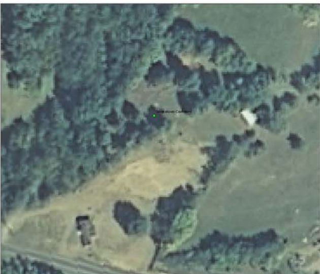
1m NAIP Orthophoto 1:750