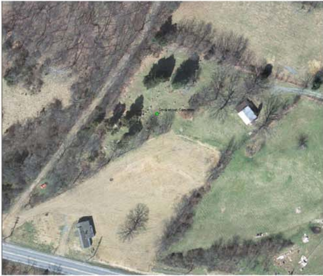
3" Orthophoto 1:750