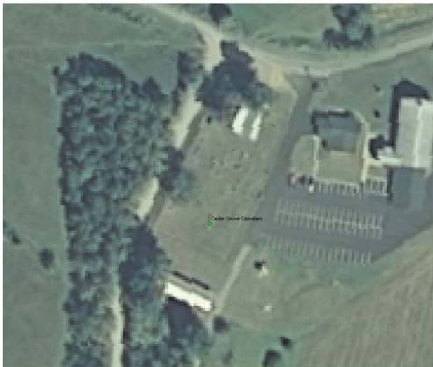
1m NAIP Orthophoto 1:750