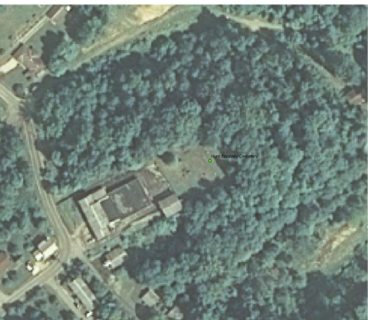
1m NAIP Orthophoto 1:1,000