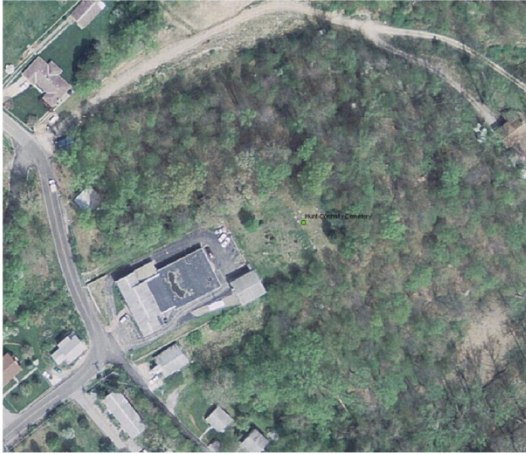
Charleston Region 1' Imagery 1:1,000